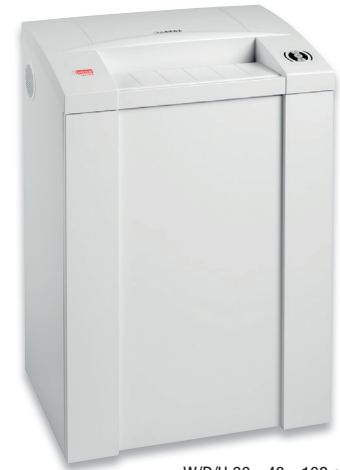
W/D/H 66 x 43 x 102 cm

Professional Data Shredders – a Synthesis of Technology, Performance and Design. All intimus® shredders are built from durable, precision engineered, high-performance components, designed for a long life of high volume usage. The product range covers all requirements from day-to-day office use up to High Security Shredding machines in use for destruction of classified material in line with all current legal requirements such as DIN 66399 or NSA 02/01. intimus® shredders carry various features which make them unique in user-friendliness and operating efficiency.