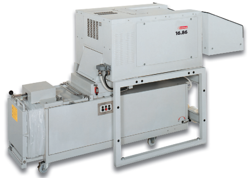
W/D/H 268/327 x 80 x 164 cm

For decades, the intimus® heavy duty shredders have proven to be centrally positioned pieces of equipment for the privacy-friendly disposal of disused media. The model range offers variations that can handle up to 550 sheets/h or even complete folders in a single operation. The spacious feed table with integrated infeed conveyor belt provides controlled, effortless, safe and fast loading. The shredded material is collected in large-scale, mobile or swing-out containers under the cutting mechanism. The shred-press combinations are coupled to a baler for immediate fully automatic compaction of the cut material into compact bales.